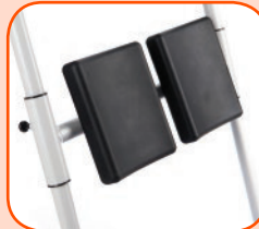
ADJUSTABLE KNEE PAD HEIGHT AND ANGLE

The knee pads are height adjustable between 345mm - 515mm to suit a range of patient sizes. They can be independently tilted and/or re-positioned horizontally. Optional padded covers provide additional comfort.