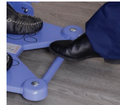
FOOT SUPPORT BAR/ CARRY HANDLE