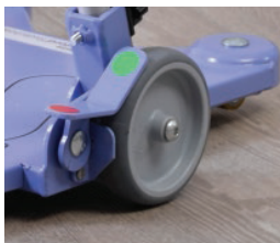
INDEPENDENTLY BRAKED CENTRAL WHEELS