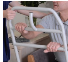
MULTI HAND-HOLD POINTS FOR COMFORT