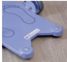
BASE RECESS ALLOWS GOOD TOILET ACCESS