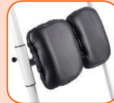
OPTIONAL KNEE PAD CUSHIONS FOR COMFORT