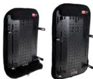
Padding tucks under back support when at lower height range