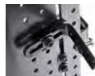
For narrow width wheelchairs