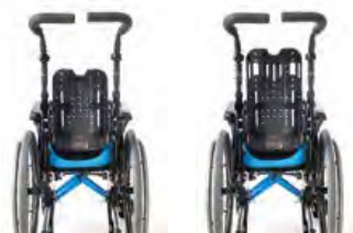
Height adjustment feature