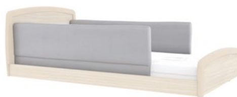
Folding side rails with bumpers