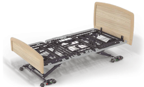
1050MM WIDTH ADJUSTMENT