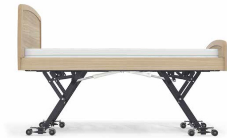
FULL NURSING HEIGHT 800mm