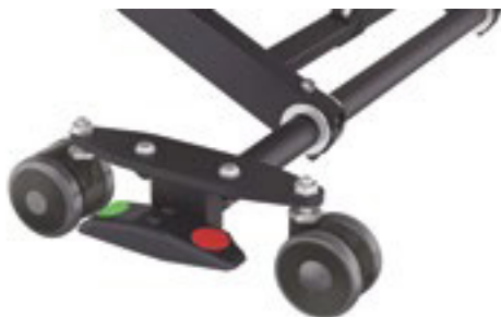
UNISAFE™ BRAKING SYSTEM