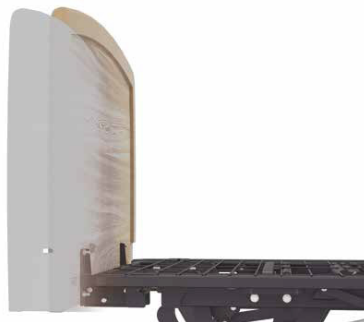
BUILT-IN LENGTH EXTENSION