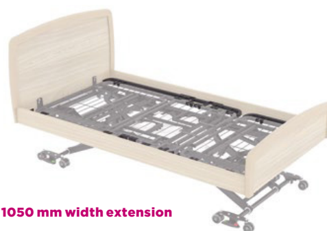
1050 mm width extension