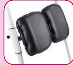
OPTIONAL KNEE PAD CUSHIONS FOR COMFORT