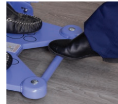
FOOT SUPPORT BAR/ CARRY HANDLE