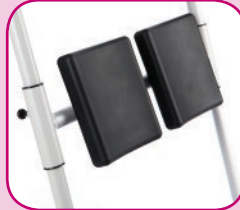
ADJUSTABLE KNEE PAD HEIGHT AND ANGLE

The knee pads are height adjustable between 345mm - 515mm to suit a range of patient sizes. They can be independently tilted and/or re-positioned horizontally. Optional padded covers provide additional comfort.