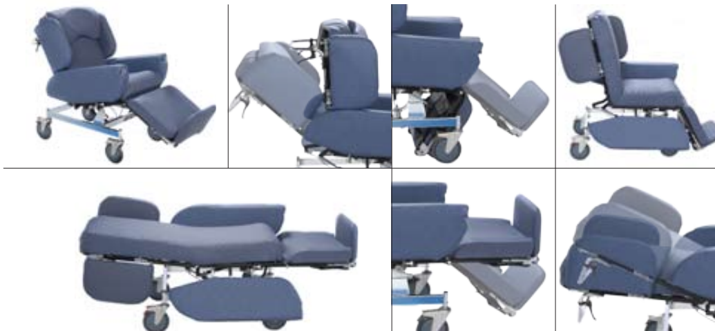
All images shown are Model CH-3125 unless otherwise stated.

State-of-the-art Functionality and Built to Survive