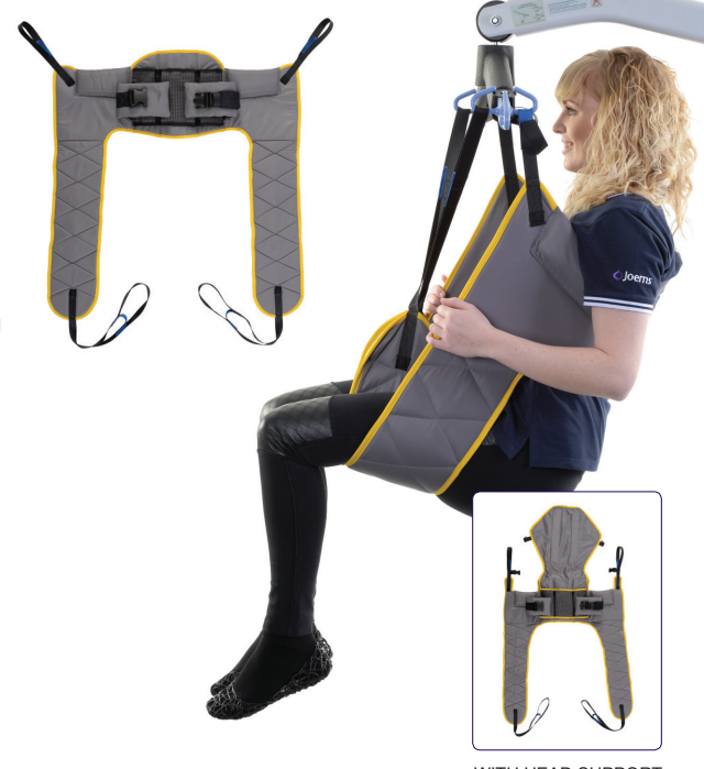
WITH HEAD SUPPORT