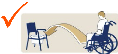
Chair to Commode/Toilet