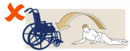
Floor to Bed/Chair