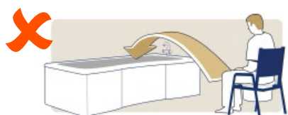
Transfer to Bath