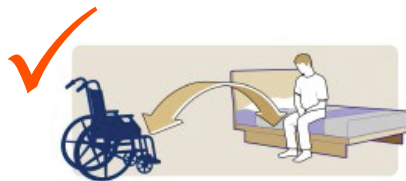
Bed to Chair/Chair to Bed (From/to seated position)