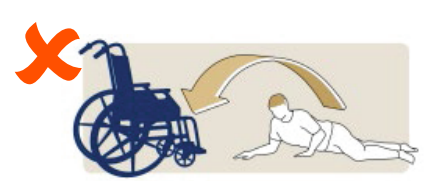
Floor to Bed/Chair