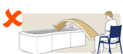
Transfer to Bath