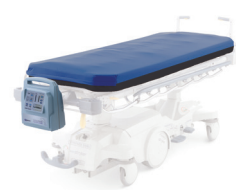
Dolphin™ Stretcher Pad