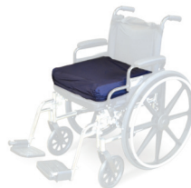
Dolphin™ Wheelchair Cushion